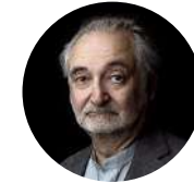
Jacques Attali - Video French economist, writer and senior civil servant. Former adviser to President Mitterrand and first president of the European Bank for Reconstruction and Development