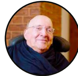
(Feu) Philippe Pozzo Di Borgo

Journaliste, présentatrice TV et radio, réalisatrice et auteure