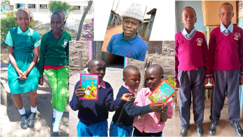
Supported project: Street Kids - Nairobi

« An international event in Geneva, delivering concrete human impact. »